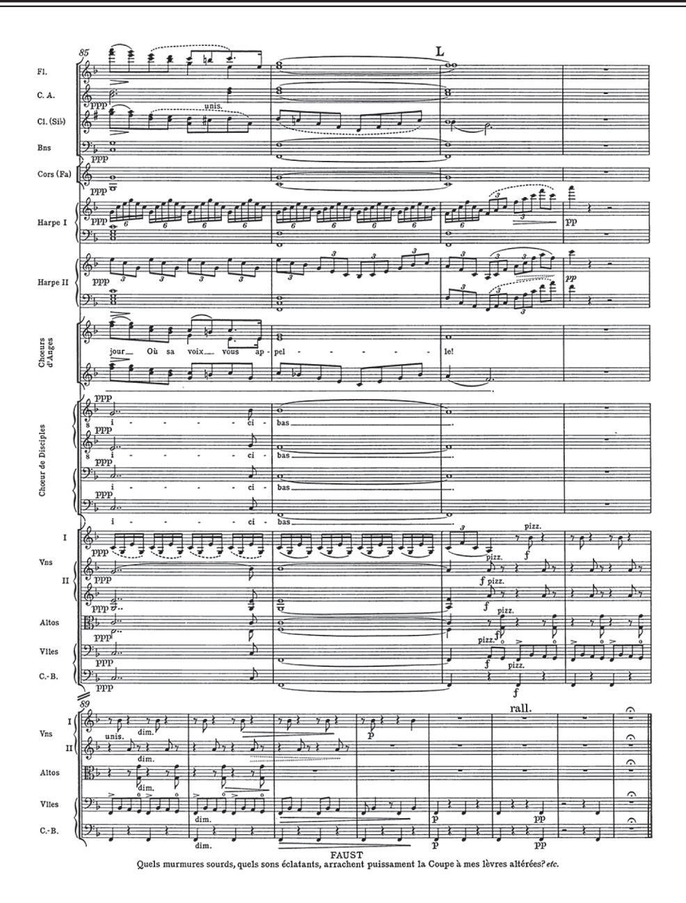
Fig. 2. H. Berlioz «Eight scenes from «Faust» by Goethe». «Easter carols' (ending)