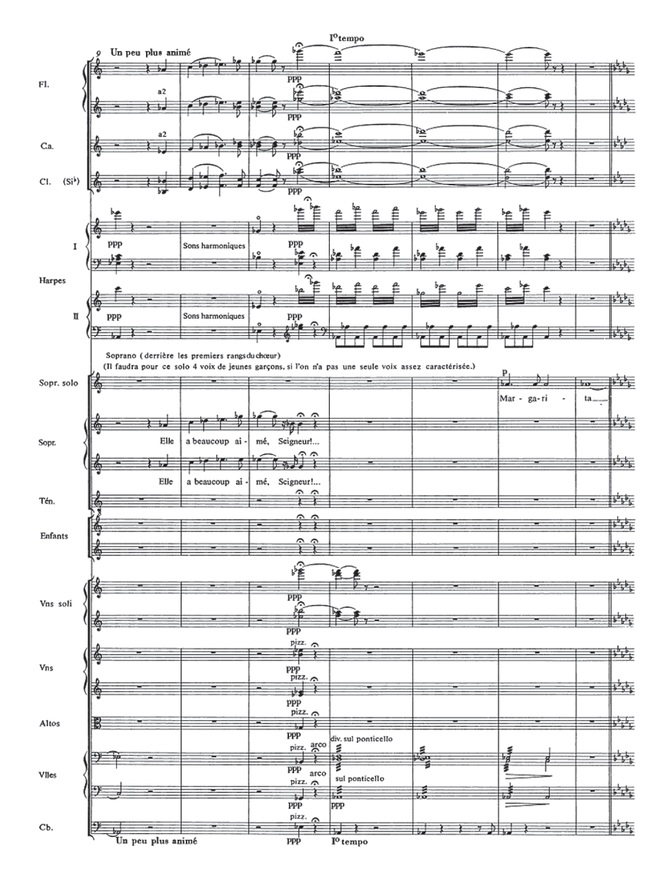
Fig.7. H. Berlioz «La Damnation de Faust». Epilogue (ending of the choir of seraphim before the throne of the Most High)

formed by the unison sound of the men's choir (bass). The composer remarks du Récitatif, plus sombre, sotto voce determine the nature of performance: dark (in a low voice) vocal and voice intoning on the background of drawn tones in parts of low string instruments (cello and contrabass), interrupted by long pauses. Multimeter ^{3}/_{4} and ^{4}/_{4} ) is an expressive technique to deliver disconnected laboured breathing of those who pronounce temperate phrases, dully coming from the underground depths. Example 6.