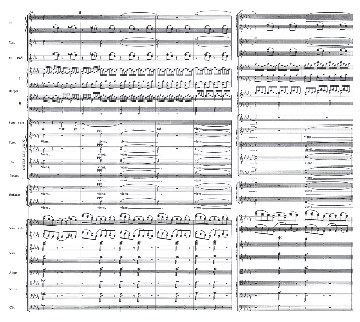
Fig. 8. H. Berlioz «La Damnation de Faust» (ending)

noted a special ability of Berlioz to the express elegy and lyrical emotion in music: «Berlioz feels with such an intimate tenderness, with such depth ...». Pages of the score «La Damnation de Faust» exhibit high dramatic skill of the composer, musical expression and unique brilliance and transparency of orchestral colour, bright theatricality of images. Berlioz created a four-voice vocal and symphonic concept in original literary and musical genre of dramatic legend for the modern musical and theatrical implementation of faith loss dramatically experienced by the hero.